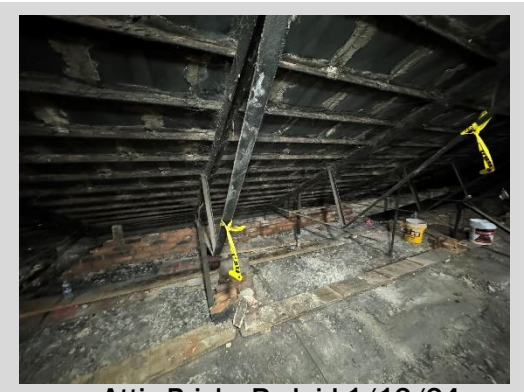
Attic Bricks Re-laid 1/12/24