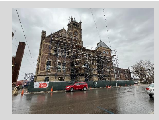
East Elevation Scaffolding 1/12/24