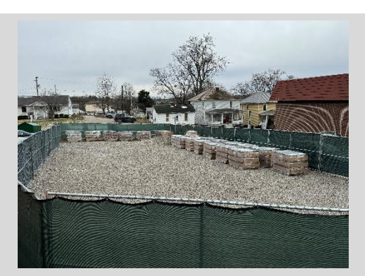
Ludowici Tile Stored Onsite 1/19/24