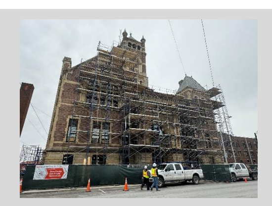
East Elevation Scaffolding 1/19/24