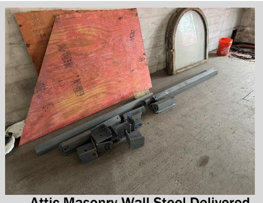
Attic Masonry Wall Steel Delivered 1/19/24