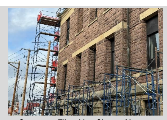
Spectrum Fiber Line Shown Above Scaffolding 1/26/24