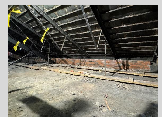
Attic Masonry Knee Wall Complete East Side 1/26/24