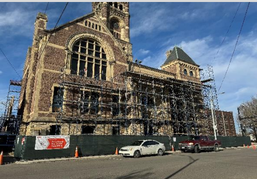
East Elevation Scaffolding 1/5/24