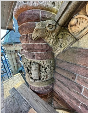
Sandstone Animal Carvings As Seen On The East Exterior Elevation