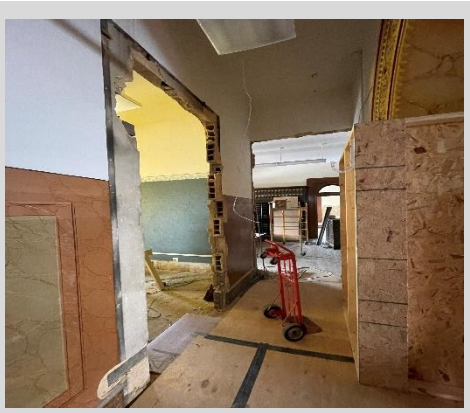
Frames & Doors Removed for Storage