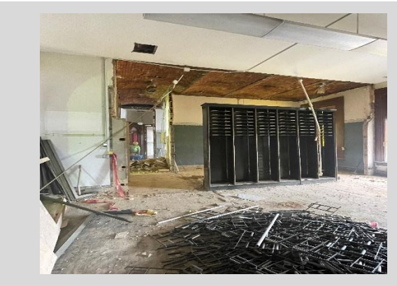
Wall Demo 2nd Floor