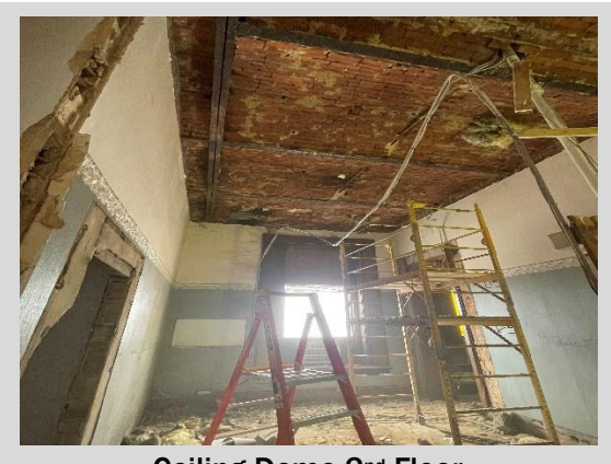
Ceiling Demo 2nd Floor