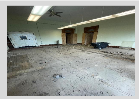
Flooring Demo 1st Floor