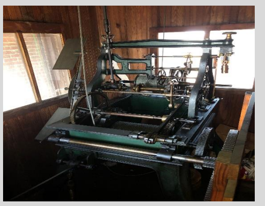
Clock Tower Walkthrough