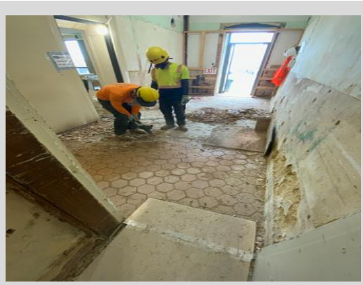
Tile Demo Ground Floor