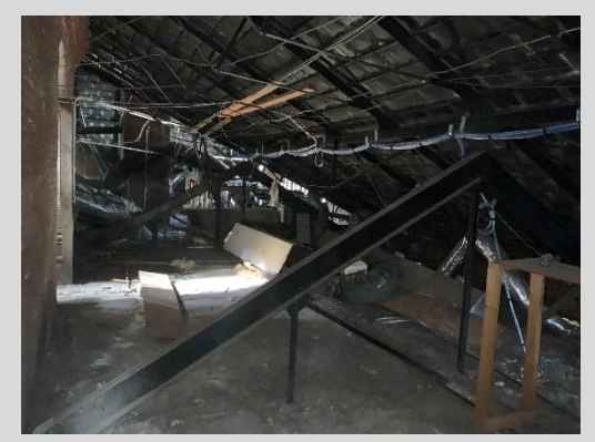
Before MEP Removal In Attic