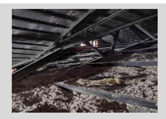
Insulation Demo Of Main Courtroom Ceiling