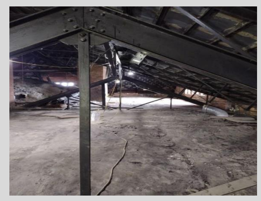
After MEP Removal In Attic