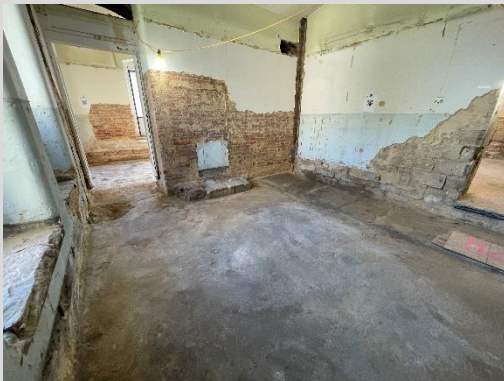
Raised Wood Flooring Demo Ground Floor