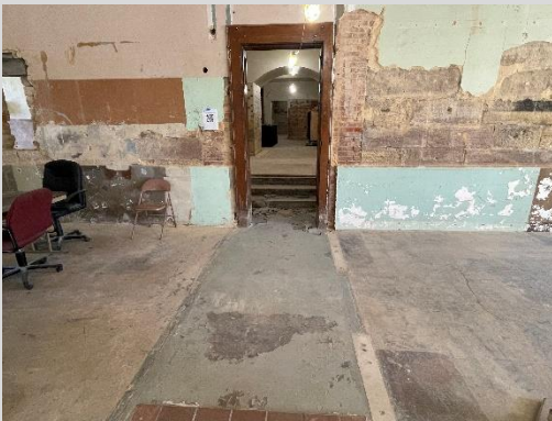
Ramp Demo On Ground Floor