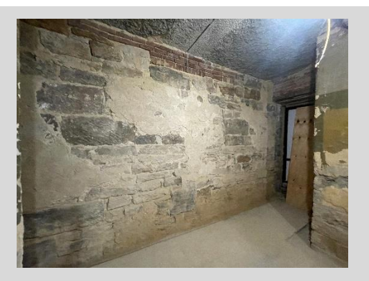
Brick Wall Demo Ground Floor Bathroom