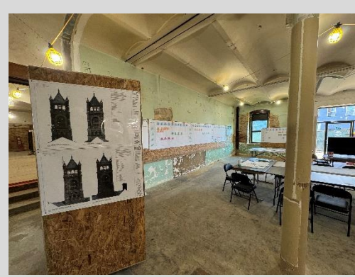
Exterior Pull Planning Session 11/9/23

Schooley Caldwell Released Phase 2 Permit Bid Set 11/9/23. CK Project Team To Review.