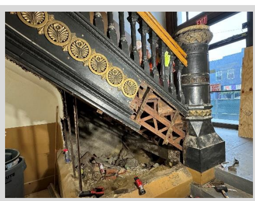
Historic Stair Exploration 12/1/23