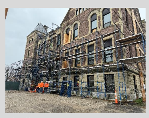
Scaffolding North Elevation 12/1/23