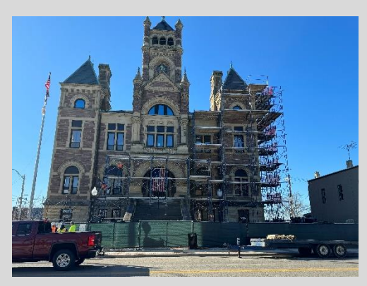
Scaffolding East Elevation 12/15/23