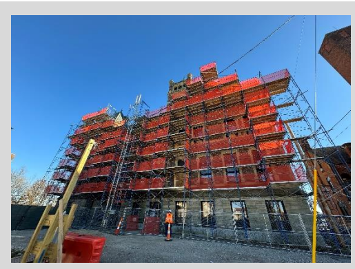
Scaffolding North Elevation 12/15/23