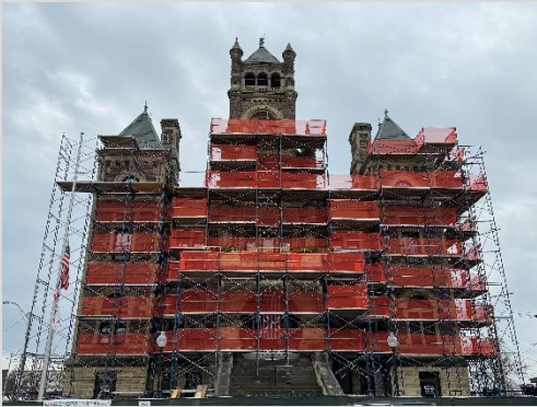
Scaffolding East Elevation 12/22/23