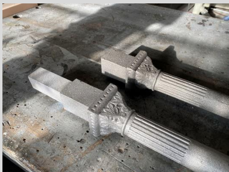
Replicated Cast Iron Baluster Seen Next To Existing 12/22/23