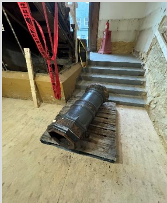
Large Newel Post Removed 12/28/23