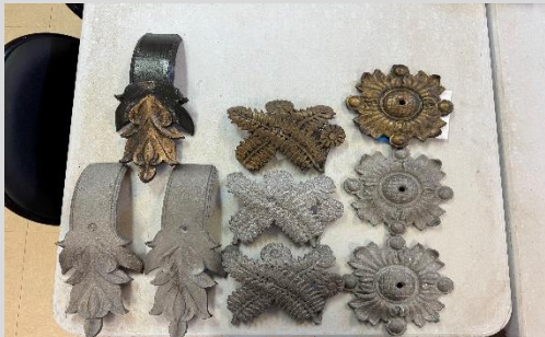
Replicated Cast Iron Ornaments Next To Original Painted Ornaments 12/28/23