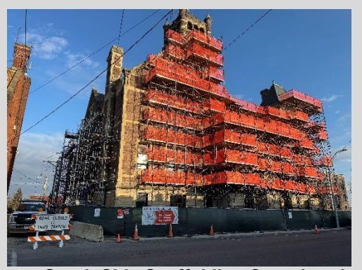
South Side Scaffolding Completed 2/9/24