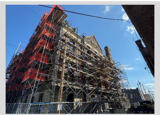
West Side Scaffolding 2/9/24