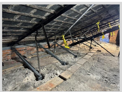
North Elevation Attic Support Steel 2/9/24