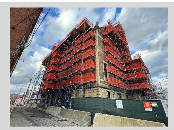
South & West Side Scaffolding 2/9/24