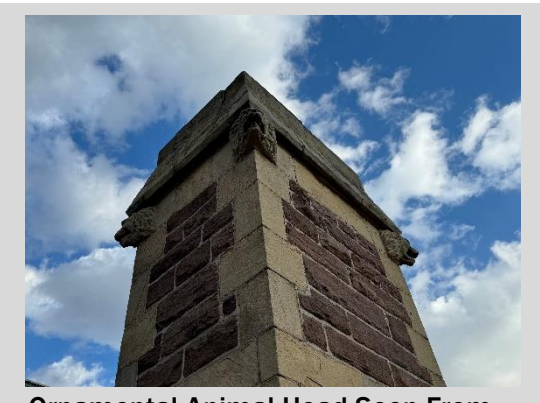
Ornamental Animal Head Seen From West Side Scaffolding 2/16/24