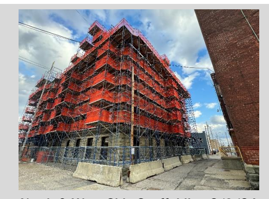
North & West Side Scaffolding 2/9/24