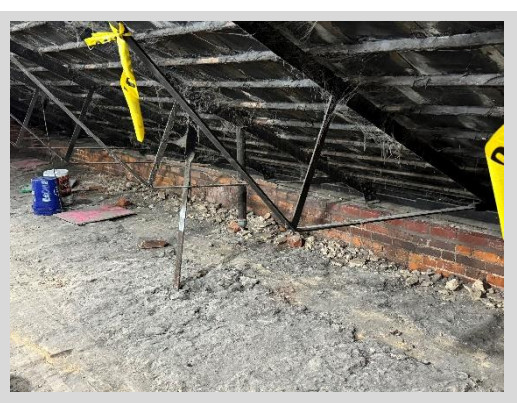
South Attic Knee Wall 2/23/24