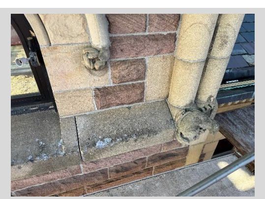
Mortar Joints Removed From Sandstone 2/23/24