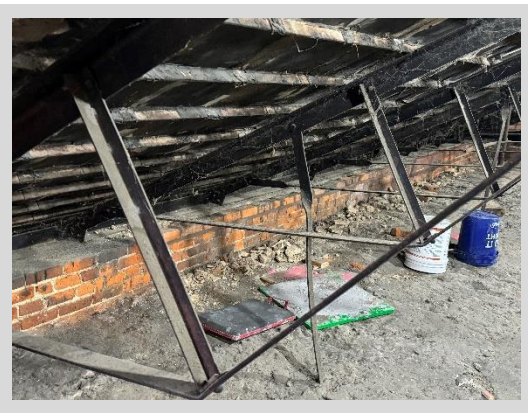
South Attic Knee Wall 2/23/24