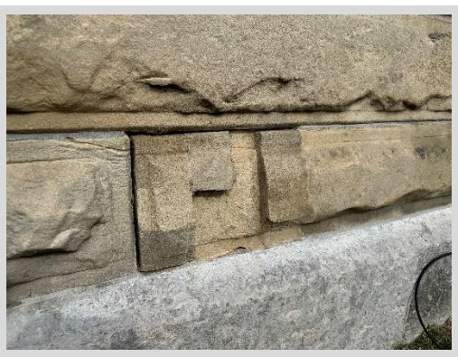
Stone Patching Mockup & Samples 3/1/24