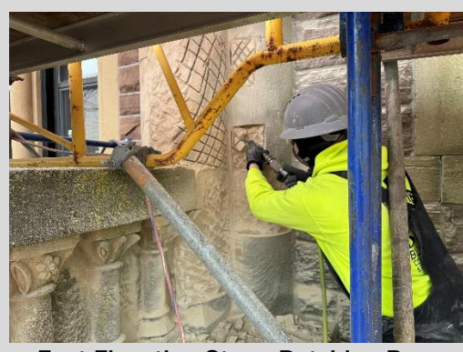
East Elevation Stone Patching Prep 3/1/24