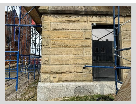
Stone Cleaning Mockup 3/1/24