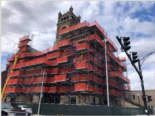
South Elevation 3/8/24