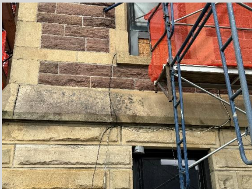
South Elevation Stone Cleaning 3/8/24