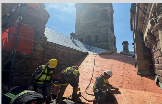
East Elevation Roof Sheathing 3/29/24