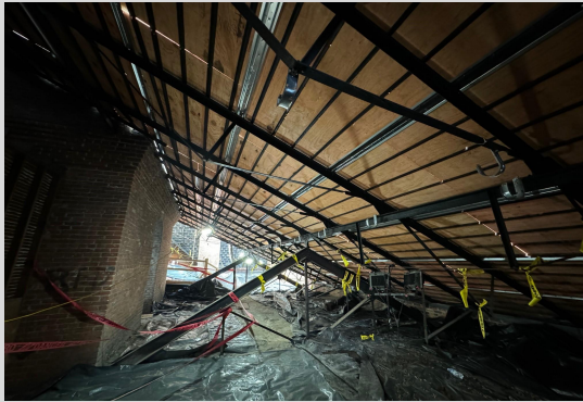
New Roof Sheathing Seen From Attic 3/29/24