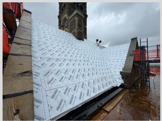
West Elevation Roofing 4/12/24