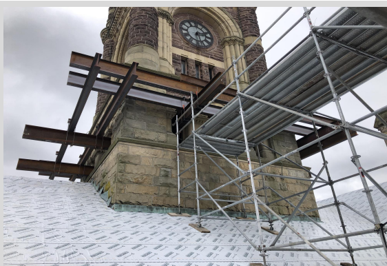
Bell Tower Structural Scaffolding Base 4/19/24