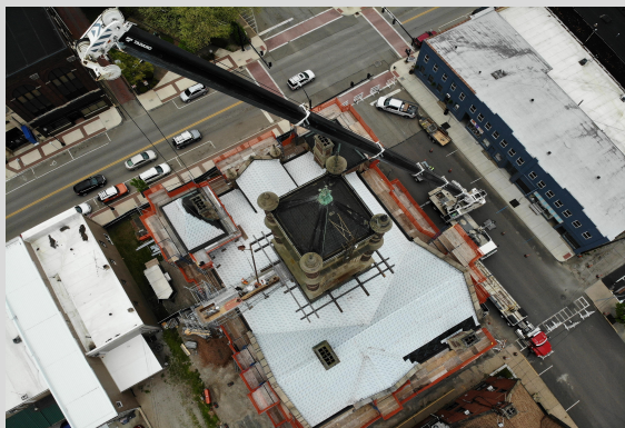
Install Of Bell Tower Structural Scaffolding Base 4/19/24