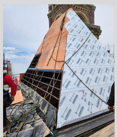
Southeast Tower Roofing 4/26/24